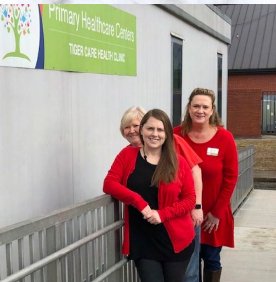
Tiger Care Health Clinic