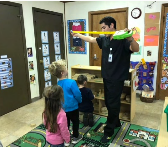
Dental Care at Head Start for Childrens