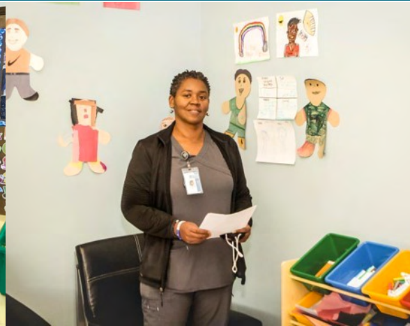
Dorothy Height Elementary