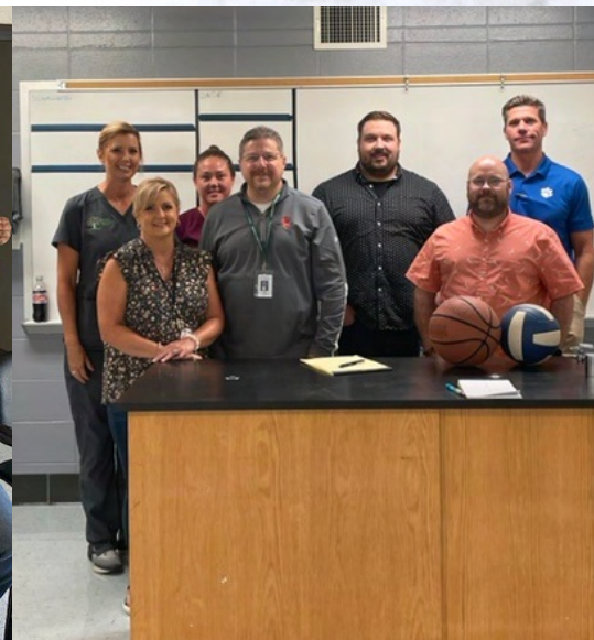
Ringghold High School